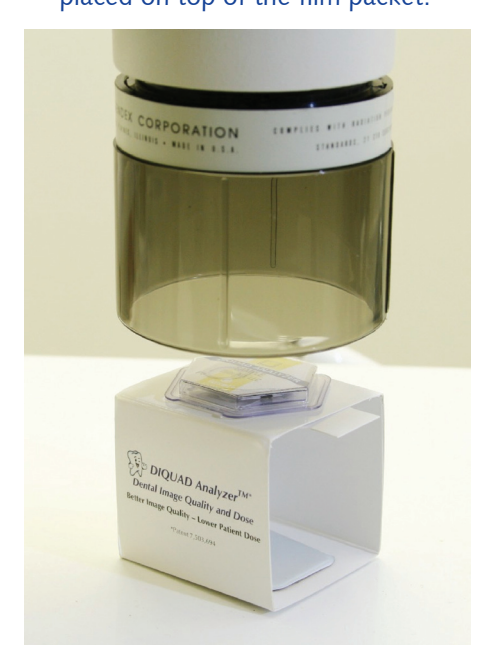
Figure 1. An Analyzer for evaluating intraoral image quality and patient dose. It consists of a cube (approximately 2"), a radiation dosimeter and test patterns (on top), and a dental film packet containing D- and F-speed films. For digital systems the sensor is placed on top of the film packet.

This provides a service to you as it allows you to compare the quality of your intraoral radiographs, photographic processing (if you are using film), and the radiation dose to your patients with your colleagues in the state of North