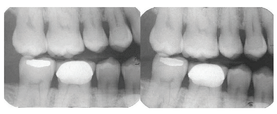
D-Speed Film 240 mrad

The image quality for D- and E-F or F-speed films is the same and there is a dose reduction of 40% to 50% with the faster films!